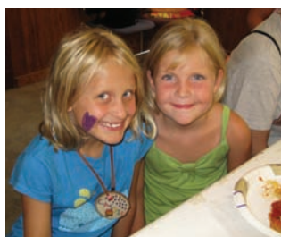
Campers make close friends with other children they can relate to who are dealing with similar grief issues.