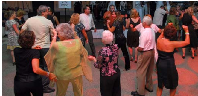
Gourmet “Late Night” Sensation added a new level of excitement at this perennial event as the band kicked it up a notch for an extended evening of dancing.

For more information on next year’s Gourmet Sensation, please contact Diana Fogel at 513- 745-1617 or diana_fogel@trihealth.com .