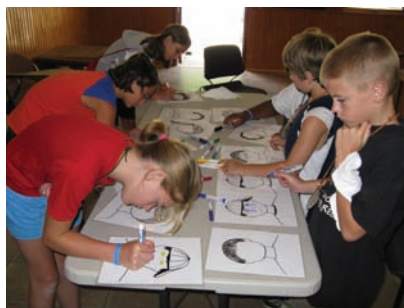
Campers use a variety of art therapy to help express their feelings and deal with their grief.