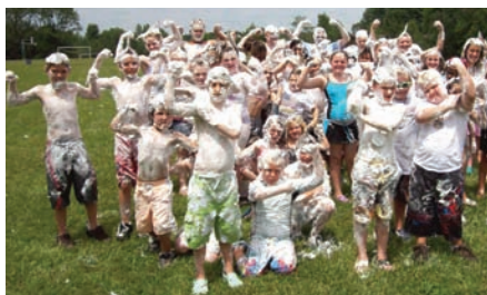
A messy but happy group poses after a shaving cream fight.

"We hope to see our program grow even more next year," Ott says.