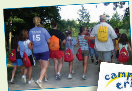
Summer Camp 2008

Call us for more information about registration or to sponsor a camper!