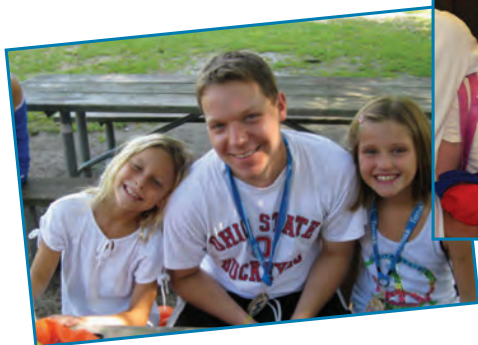
The Quinn Family in action!

April 15-21 is a week we celebrate our volunteers and the unique gifts each of them bring to Fernside. All gifts of time and talent, small and large, make a difference in the lives of the grieving children and families we serve. Thanks for all you do!